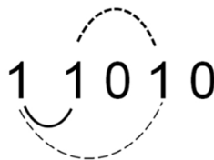
Figure 1: Pairwise distances between two years of discontinuous employment or joblessness

We use the inverse of these pairwise distances so that the higher the distance is, the lower the importance assigned to the episodes of discontinuous employment. The analytical formulation of the PJI is a linear combination of two elements, basically one focussing on LP and IP and the other focussing on the recentness of the spells of discontinuous employment: