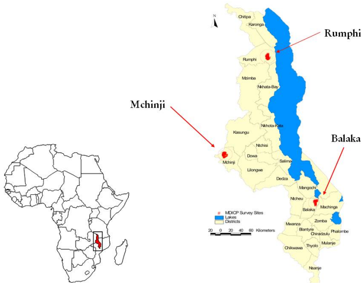
Figure 1: Malawi map with MDICP & MRP research locations highlighted

Drawn from 119 rural villages, the sample includes roughly 1500 ever married women and 1000 of their spouses in each of the interview years (1998, 2001, 2004, and 2006). Researchers have shown favorable evaluation of these data's reliability, attrition, and representativeness (Anglewicz et al. 2009; Bignami-Van Assche, Reniers and Weinreb 2003; Watkins and Warriner 2003; Watkins et al. 2003). Analyses of the MDICP data have been used to describe numerous HIV-related issues in Malawi, such as risk perception (Behrman, Kohler, and Watkins 2007; Bignami-Van Assche et al. 2007; Helleringer and Kohler 2005), related behaviors (Kaler 2004; Trinitapoli and Regnerus 2006), infection rates (Obare 2005; Obare et al. 2008), and care giving (Chimwaza and Watkins 2004).